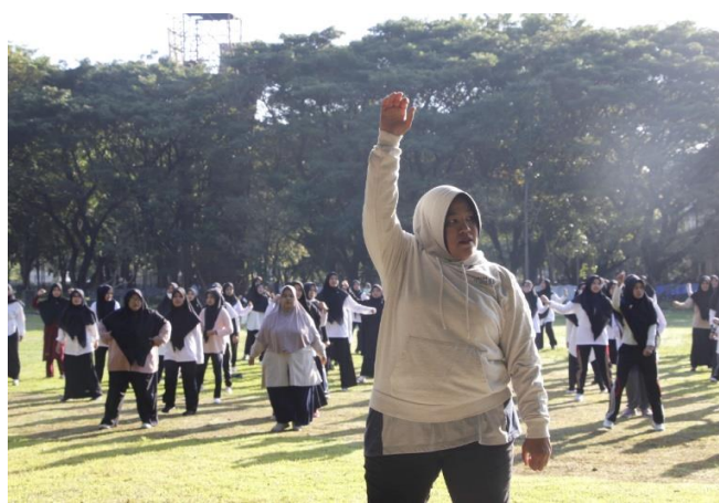
Figure 2: Photo of Spirit+ gymnastic activities with students and the community which is routinely carried out every Saturday.