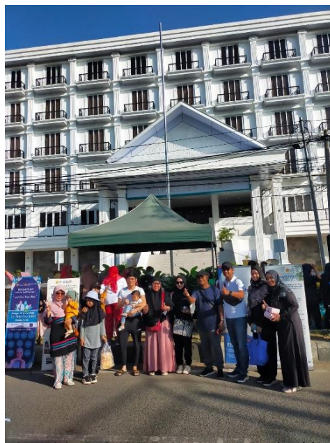
Figure 2. Activity in Car-Free-Day to promote healthy lifestyle

By bringing community members together to participate in shared activities, the program can foster a sense of social connectedness and support, which can enhance mental health and well-being. Moreover, the program's emphasis on community engagement can help build trust and collaboration between different groups, which can facilitate broader community development efforts.