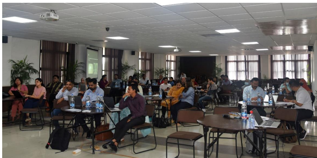
Participants attending the training.