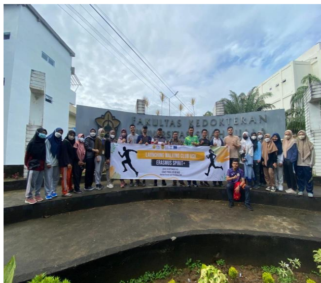
Figure 1 : Poster for the launch of the Erasmus Spirit+ Walking Club.